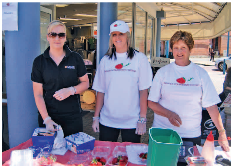
Staff from Craig's Investment Partners volunteer at the Strawberry Festival.

celebrations ($16,000), and the Queen Charlotte Classic Race. Thank you to everyone involved in these and other events designed to support hospice.